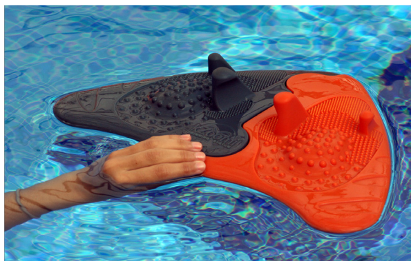
This fully functional 3D printed prototype was tested in real conditions and enabled AIJU to verify and validate the design fast.

For AIJU and others producing consumer goods, the ability to change designs easily without painstaking manual work eliminates costly intermediate prototype stages that can take weeks. In addition, printing batches of prototypes lets product engineers test multiple features, designs and improvements simultaneously, eliminating time-wasting when trying to perfect a client-ready presentation model one iteration at a time.