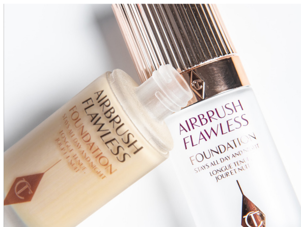
The GrabCAD Print™ slicer on the Stratasys J-Series Full Color 3D Printers makes it possible to simulate glass or transparent acrylic packaging containers alongside advanced textures and vivid colors.

For many top global brands, employing full-color, multi-material 3D printed prototypes across the product development is the key to rapid growth. Not only does the process help create a better product, it does so in less time while saving thousands of dollars. Many in the consumer goods