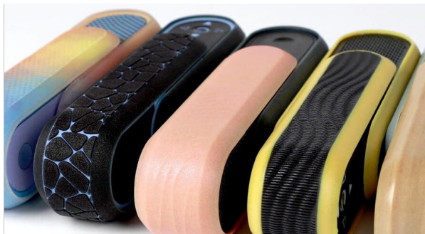
Test concept and fit with realistic, 3D printed prototypes.

With advanced colors and materials, your development cycle can now be accomplished in a single print. A 3D printer with true, full-color capabilities, texture mapping and color gradients creates prototypes that look, feel and operate like finished products, without the need for painting or assembly. In addition to color, advanced material properties ranging from rigid to flexible and opaque to transparent are also possible.