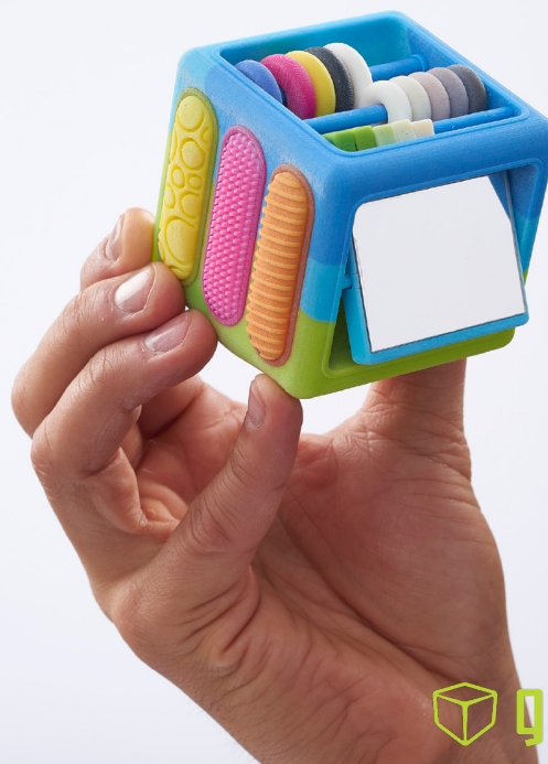
3D printed concept models can feature full-color, advanced textures and moving parts.

Leading consumer goods market leaders build in full-color, advanced textures and a broad range of material properties, including transparent and rubber, making the Stratasys J-Series Full Color 3D Printers an ideal solution for rapid prototyping in the fast-moving consumer goods market. The Stratasys J-Series Full Color 3D Printers maximizes uptime and the diversity of jobs that can be handled with one system, which means product developers and designers deliver realistic packaging prototypes faster, allowing for a more detailed evaluation sooner for key moments in the development process, such as client presentations, focus group and testing.